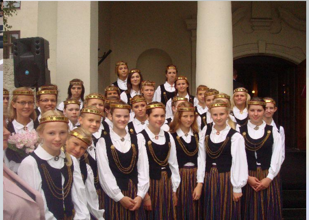
The choir "Dzeguzītes"