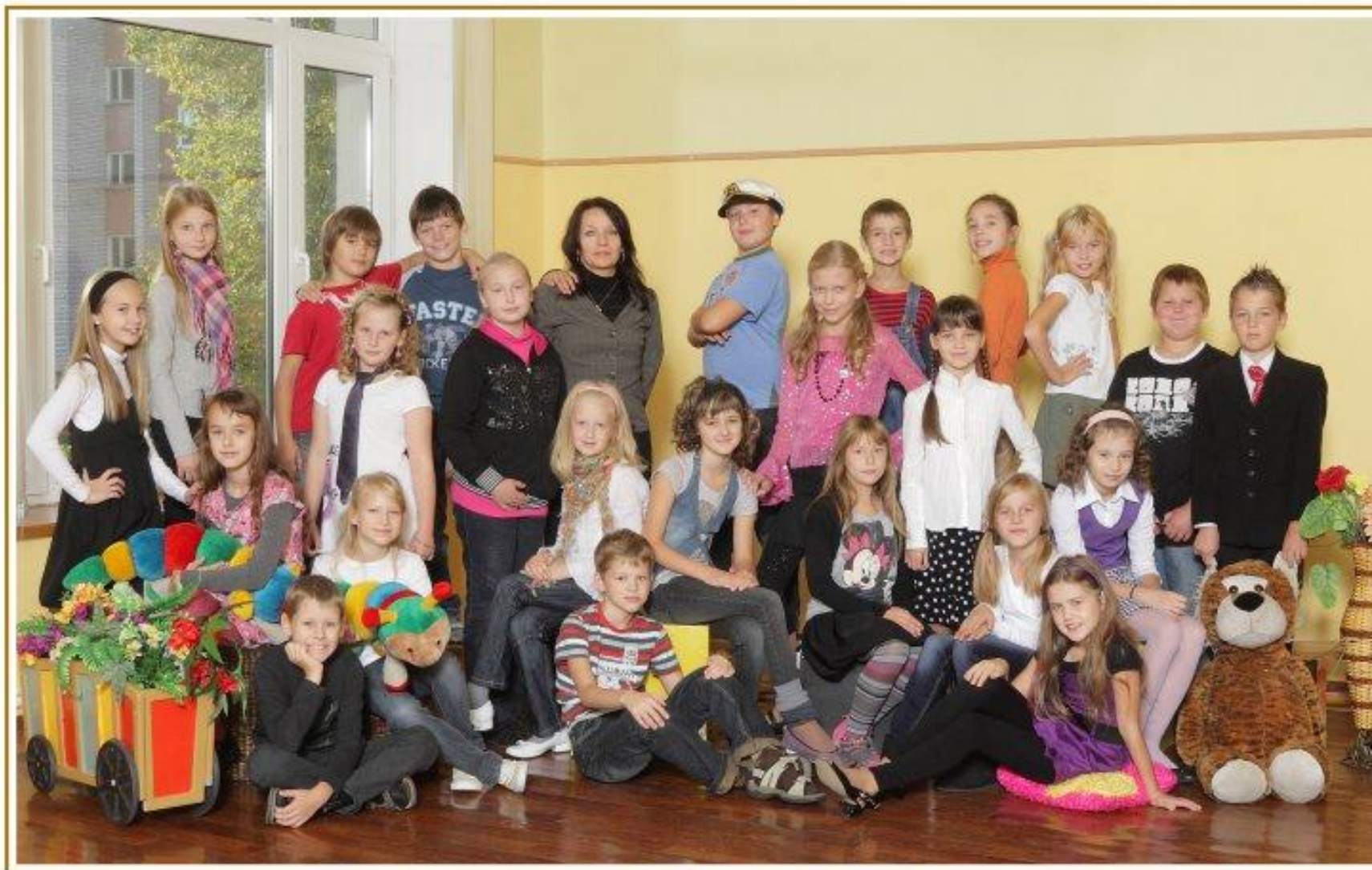
Ventspils Centra pamatskola 3.6 klase 2010./2011. mācību gads